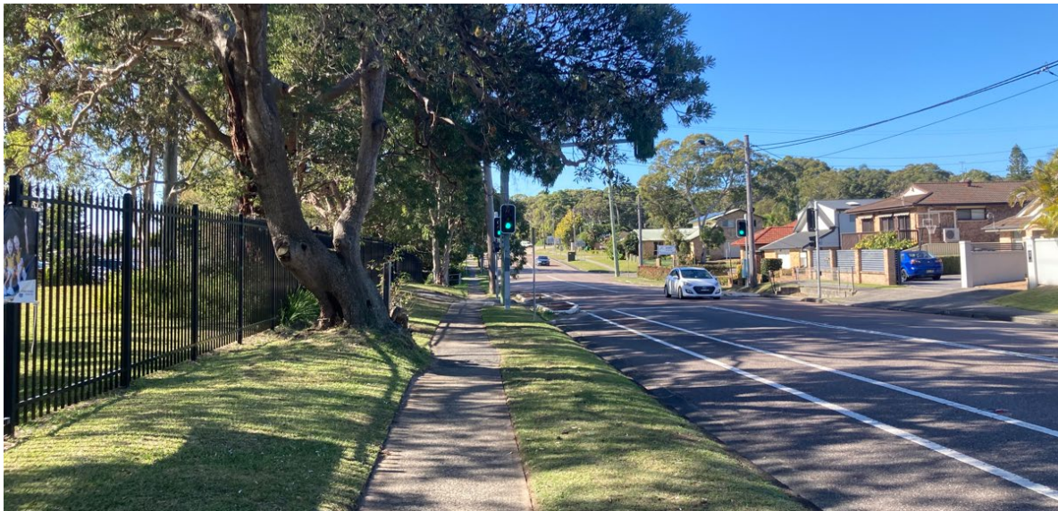
Figure 6 Fencing along the site frontage