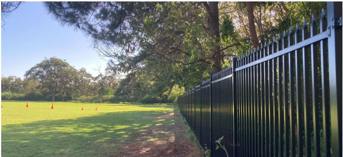
Figure 4 Fencing around the school oval – eastern boundary