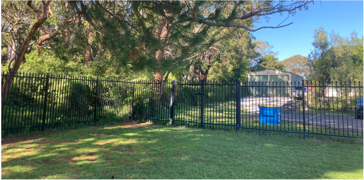
Figure 3 Fencing around the school oval, adjoining the car park